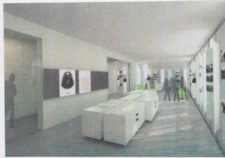
as it will look when finished